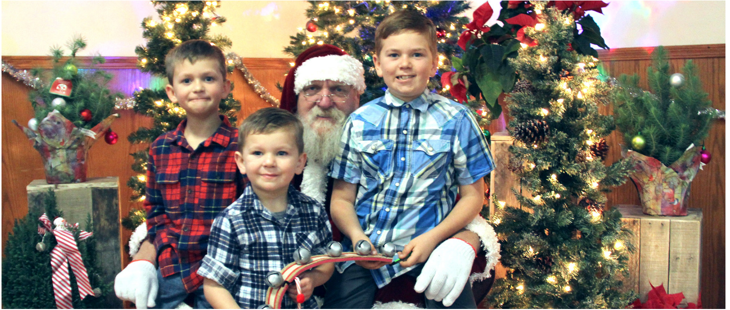
Little Red Hen's Annual Breakfast with Santa fundraiser

Santa recently made a trip to our Annual Breakfast with Santa fundraiser! Over 350 tickets were sold for this merry holiday breakfast, with all profits going back into our children's programs. If you couldn't make it out this year don't worry, you can still help support our children and adult programs by shopping any of our 5 retail stores or