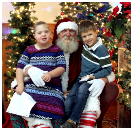
Santa listened to everyone's Christmas wishes

Donate at any LRH store or online at LittleRedHen.org